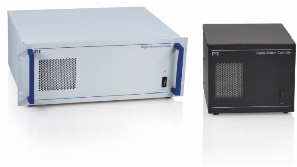
Fig. 2 Powerful digital controller with open software architecture

Depending on the application requirements, they are driven by high-precision drive screws and precisely controllable DC motors or directly by linear motors, e.g. based on piezo actuators. Matching digital controllers (Fig. 2) and extensive software support make it easy for the user to solve each positioning task without great effort.