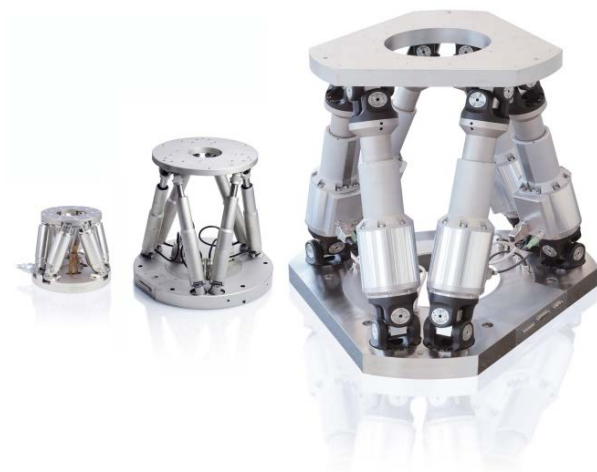
Fig. 1 Depending on design, Hexapods can position loads ranging from a few kilograms to a few hundred kilograms or even to several tons in any desired orientation in space at high precision

Hexapods allow individual positioning in all six axes. Their parallel-kinematic structure is considerably more compact and stiffer than that of serially stacked multi-axis systems. Moreover, there is no accumulation of guiding errors and tilt errors of the individual axes. The pivot point can be selected as desired via software commands and remains independent of the motion.