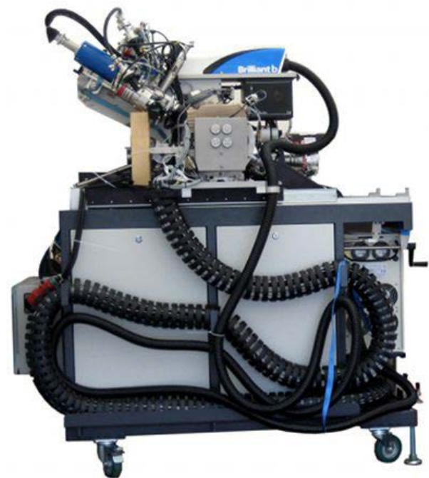
Fig. 4 New beamline PLD system for in-situ synchrotron diffraction

For direct use in such a beamline, SURFACE has now developed a new all-in-one system, which impresses in particular with its compact design (Fig. 4) and has already been tested and proven in a first project, offering scientific and commercial users the opportunity to further develop innovative technologies.