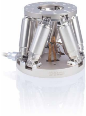
Fig. 3 The compact Hexapod is available in a version for vacuum environment of up to 10^{-6} hPa

An example of a particularly compact Hexapod, which has been tested and proven, for example, also in high-vacuum applications, is the H-811 (Fig. 3).