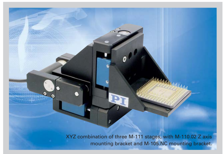
XYZ combination of three M-111 stages, with M-110.02 Z axis mounting bracket and M-105.NC mounting bracket.