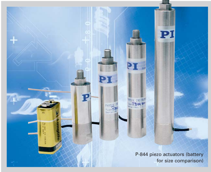
P-844 piezo actuators (battery for size comparison)

>> Click http://www.pi.ws/fwd/Piezo-Actuator for the Latest Specs on these Products