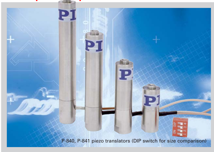
P-840, P-841 piezo translators (DIP switch for size comparison)

>> Click http://www.pi.ws/fwd/Piezo-Actuator for the Latest Specs on these Products