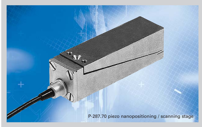
P-287.70 piezo nanopositioning / scanning stage

>> Click http://www.pi.ws/fwd/Piezo-Stage for the Latest Specs on these Products