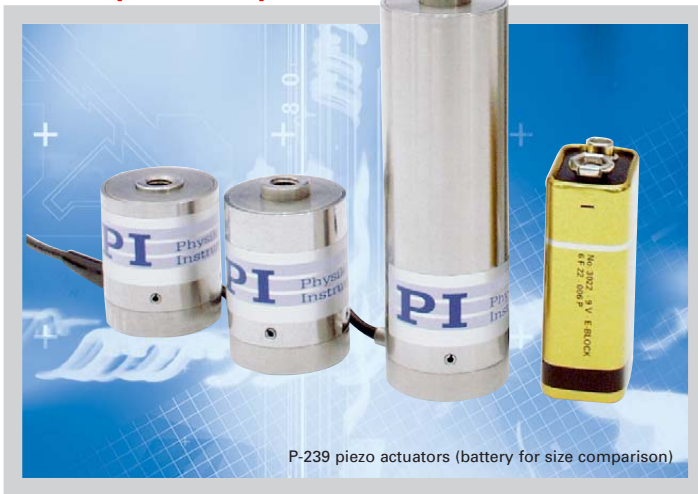
P-239 piezo actuators (battery for size comparison)

>> Click http://www.pi.ws/fwd/Piezo-Actuator for the Latest Specs on these Products