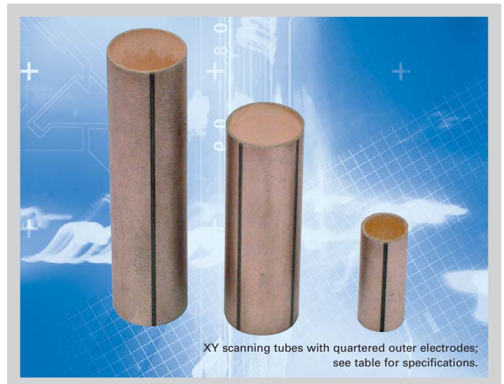
XY scanning tubes with quartered outer electrodes; see table for specifications.

Tube actuators are not designed to withstand large forces (see PICA-Thru actuators), but their high resonant frequencies make them especially suitable for dynamic operation with light loads.