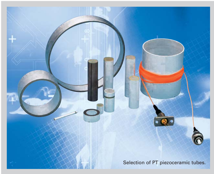
Selection of PT piezoceramic tubes.

>> Click http://www.pi.ws/fwd/Piezo-Actuator for the Latest Specs on these Products