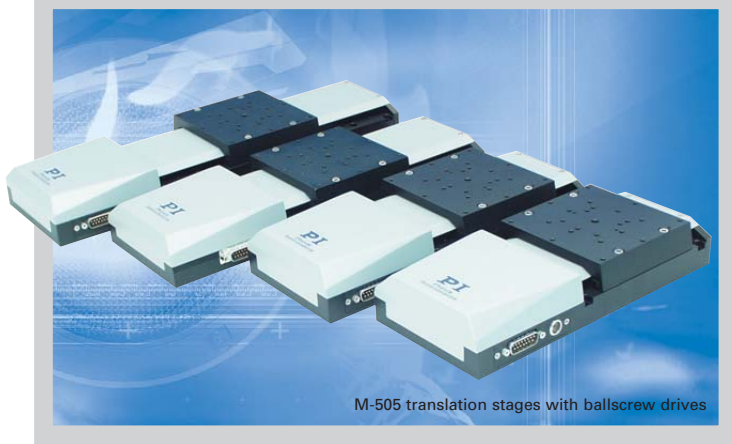
M-505 translation stages with ballscrew drives

>> Click http://www.pi.ws/fwd/Micropositioning for the Latest Specs on these Products