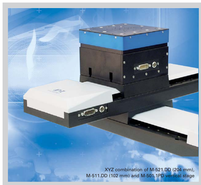
XYZ combination of M-521.DD (204 mm), M-511.DD (102 mm) and M-501.1PD vertical stage

See "Accessories", page 7-92 ff. for adapters, brackets, etc.