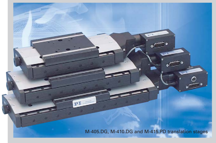
M-405.DG, M-410.DG and M-415.PD translation stages

>> Click http://www.pi.ws/fwd/Micropositioning for the Latest Specs on these Products