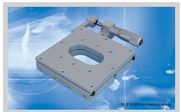
M-014.00 translation stage