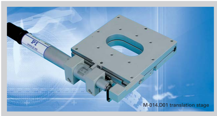
M-014.D01 translation stage

>> Click http://www.pi.ws/fwd/Micropositioning for the Latest Specs on these Products