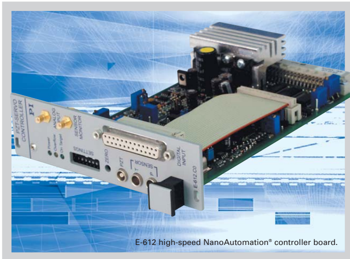
E-612 high-speed NanoAutomation® controller board.