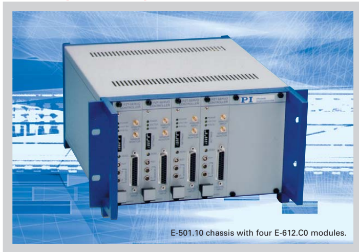
E-501.10 chassis with four E-612.C0 modules.

>> Click http://www.pi.ws/fwd/Piezo-Driver for the Latest Specs on these Products