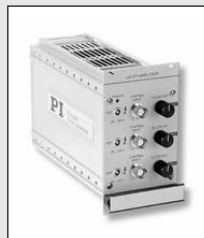
E-503, p. 6-24