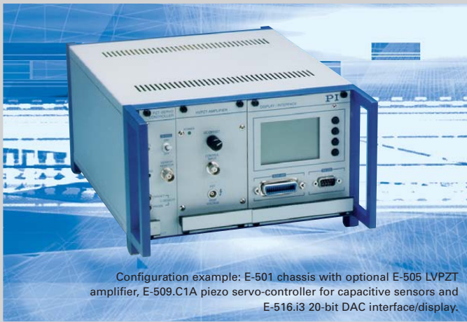
Configuration example: E-501 chassis with optional E-505 LVPZT amplifier, E-509.C1A piezo servo-controller for capacitive sensors and E-516.i3 20-bit DAC interface/display.

>> Click http://www.pi.ws/fwd/Piezo-Driver for the Latest Specs on these Products