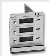
E-515, p. 6-28