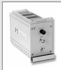
E-507, p. 6-23

E-509.L3 Piezo Sensor/Controller Module, LVDT Sensor, 3 Channels