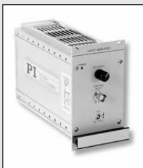
E-505, p. 6-25