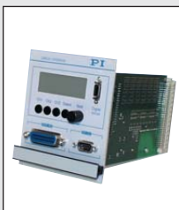
E-516, p. 6-26