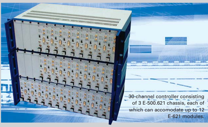
30-channel controller consisting of 3 E-500.621 chassis, each of which can accommodate up to 12 E-621 modules.