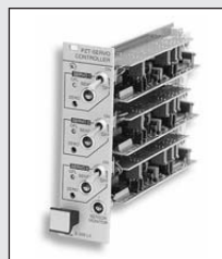
E-509, p. 6-22