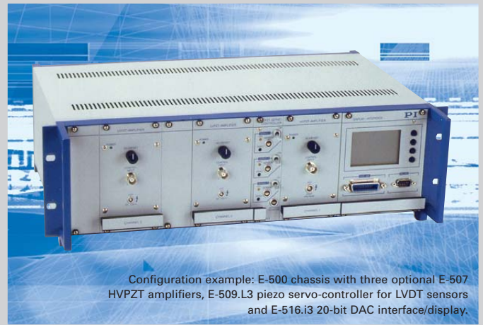
Configuration example: E-500 chassis with three optional E-507 HVPZT amplifiers, E-509.L3 piezo servo-controller for LVDT sensors and E-516.i3 20-bit DAC interface/display.