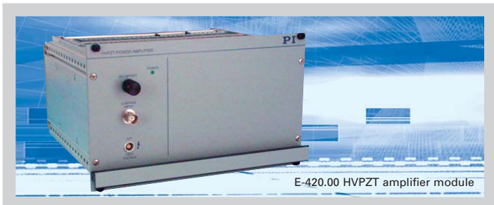
E-420.00 HVPZT amplifier module

Important Calibration Information: Please read details see page 6-53.