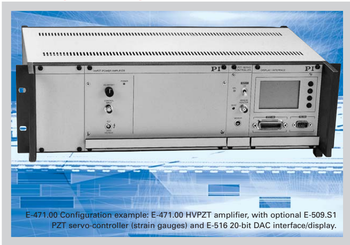
E-471.00 Configuration example: E-471.00 HVPZT amplifier, with optional E-509.S1 PZT servo-controller (strain gauges) and E-516 20-bit DAC interface/display.

>> Click http://www.pi.ws/fwd/Piezo-Driver for the Latest Specs on these Products