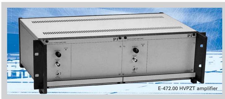
E-472.00 HVPZT amplifier