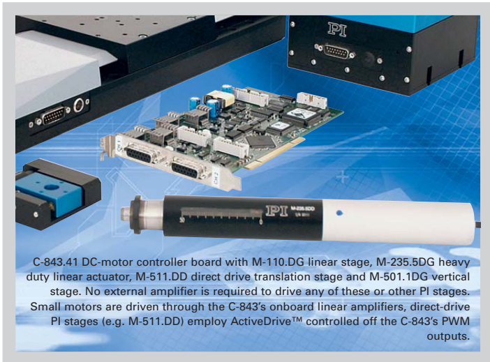
C-843.41 DC-motor controller board with M-110.DG linear stage, M-235.5DG heavy duty linear actuator, M-511.DD direct drive translation stage and M-501.1DG vertical stage. No external amplifier is required to drive any of these or other PI stages. Small motors are driven through the C-843's onboard linear amplifiers, direct-drive PI stages (e.g. M-511.DD) employ ActiveDrive™ controlled off the C-843's PWM outputs.

>> Click http://www.pi.ws/fwd/Motion-Control for the Latest Specs on these Products